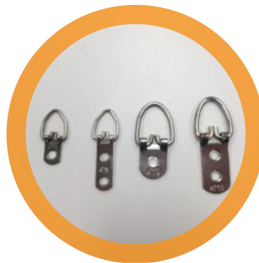
Examples of suitable D Rings