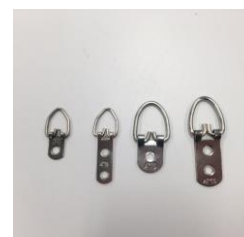
Examples of suitable D Rings

There is no need for wire between the D Rings.